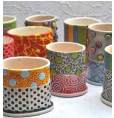
Textured Mugs or Pencil Cups